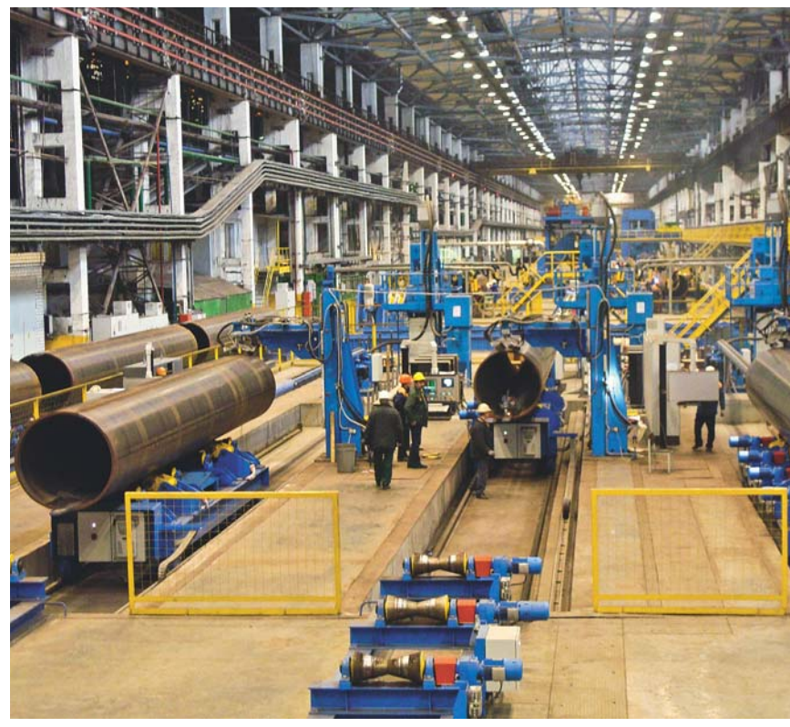
Pipe Mill large pipe making works