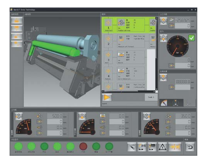
The 3D operator interface of the plate bending machines allows intuitive and convenient operation of the machine.

Haeusler's decision to use Compact Flash as the storage medium was also far-sighted considering operational reliability. As Peter Reinstadler, Area Sales Manager of Beckhoff Switzerland, says: "That means there are no moving parts in the data storage system. As a result, Haeusler can guarantee its customers high security and availability, in particular with respect to the vibrations and shocks that are unavoidable in the harsh machine environment. In addition, the memory is remanent and buffered via a UPS, so that the data are always protected."